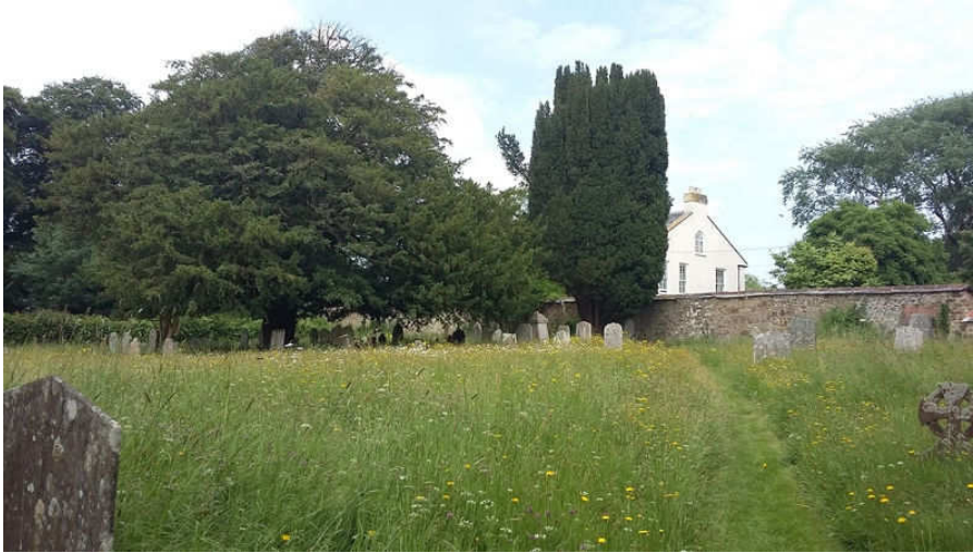
Rewilded Churchyard, All Hallows Devon