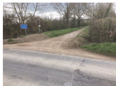
Flood alleviation - see p 3