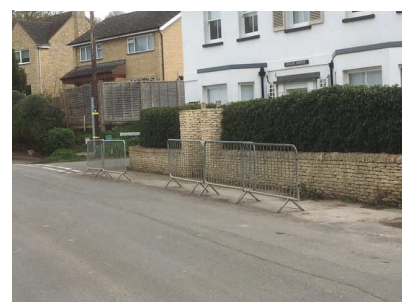
Footpath - at last? see p 2