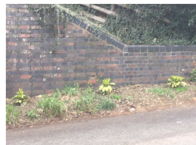
Greening plan - see p 3