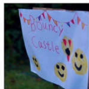
Photographs of Apple Rock Alix Scott